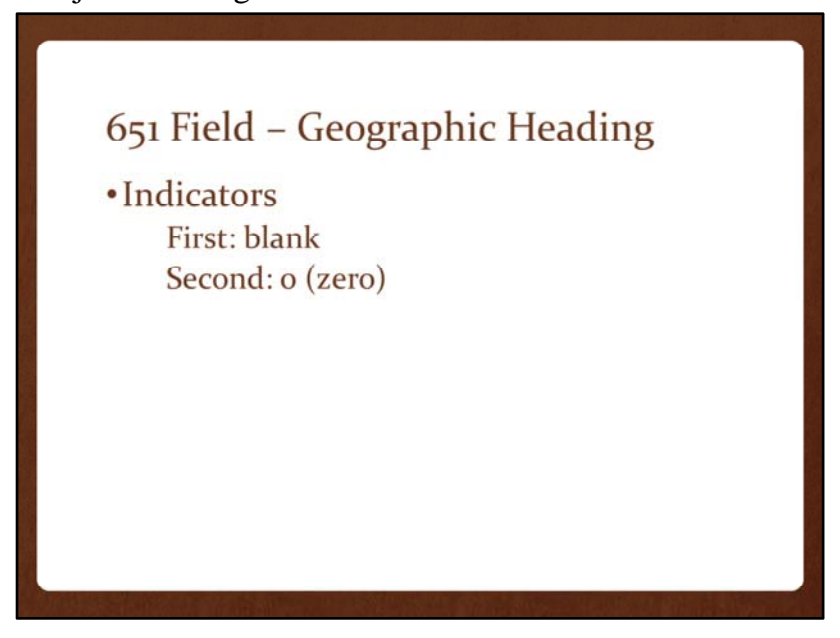
The 651 field is used for geographic headings.

Once again, the first indicator is blank and a zero in the second indicator indicates that the heading is an LCSH heading, or a geographic access point from the Name Authority File that is being used as an LC subject heading.